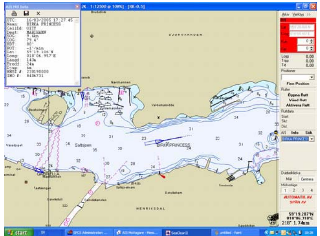
Example how AIS can be presented in a Electronic Chart System

Frequency : AIS1 161.975 MHz AIS2 162.025 MHz Sensitivity : -112dBm Antenna impedance : 50 ohms